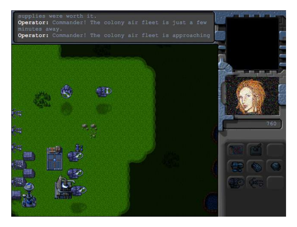
Figure 10-8. The colony air fleet flying in to save the day

Obviously, the only goal of this mission is to survive and protect the transport until the fleet arrives. If you play the mission now and survive that long, you should see the large fleet flying in and destroying the enemy, as shown in Figure 10-8.