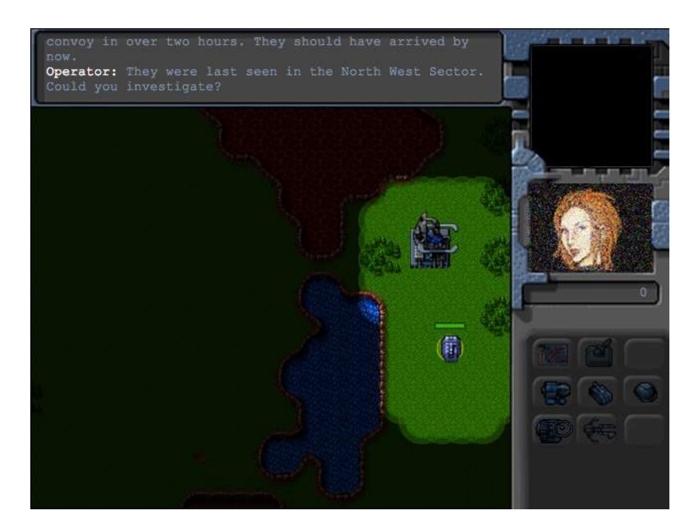
Figure 10-1. The first mission task

If you run the game so far, you should see the operator giving you your first mission task by asking you to investigate the situation, as shown in Figure 10-1.