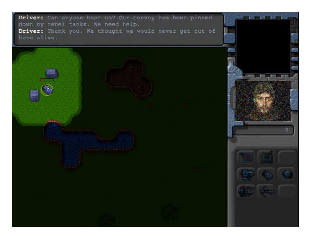
Figure 10-3. Rescuing the convoy

The return journey should be uneventful since all the enemies in this level are dead. Once the two transports reach the base, the mission will end. You have just completed your first mission in the single-player campaign. Now it's time to make the next level, Assault.