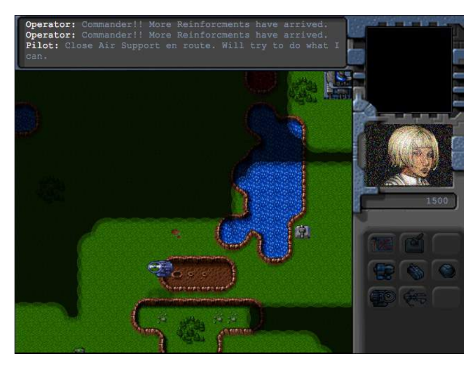
Figure 10-5. Pilot flying in chopper for air support

If you have trouble completing the mission, the extra air support should help. Again, we introduce a new character, the pilot, who will stay with us for the next mission. With the assistance of the chopper, we can capture the enemy base and complete the mission so we can go on to the final mission.