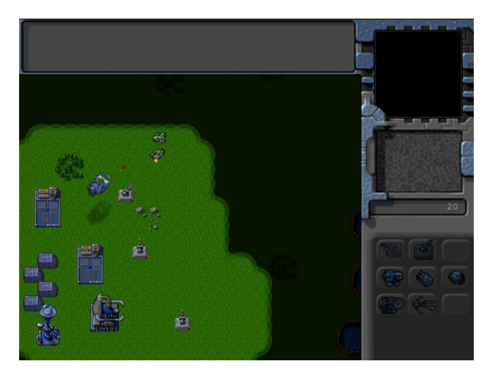
Figure 10-6. Patrolling chopper defending the base

Now that the first wave of attacks has been fended off, we will build a little drama with a small cinematic story line within the mission by adding a few creative triggers to the map, as shown in Listing 10-16.