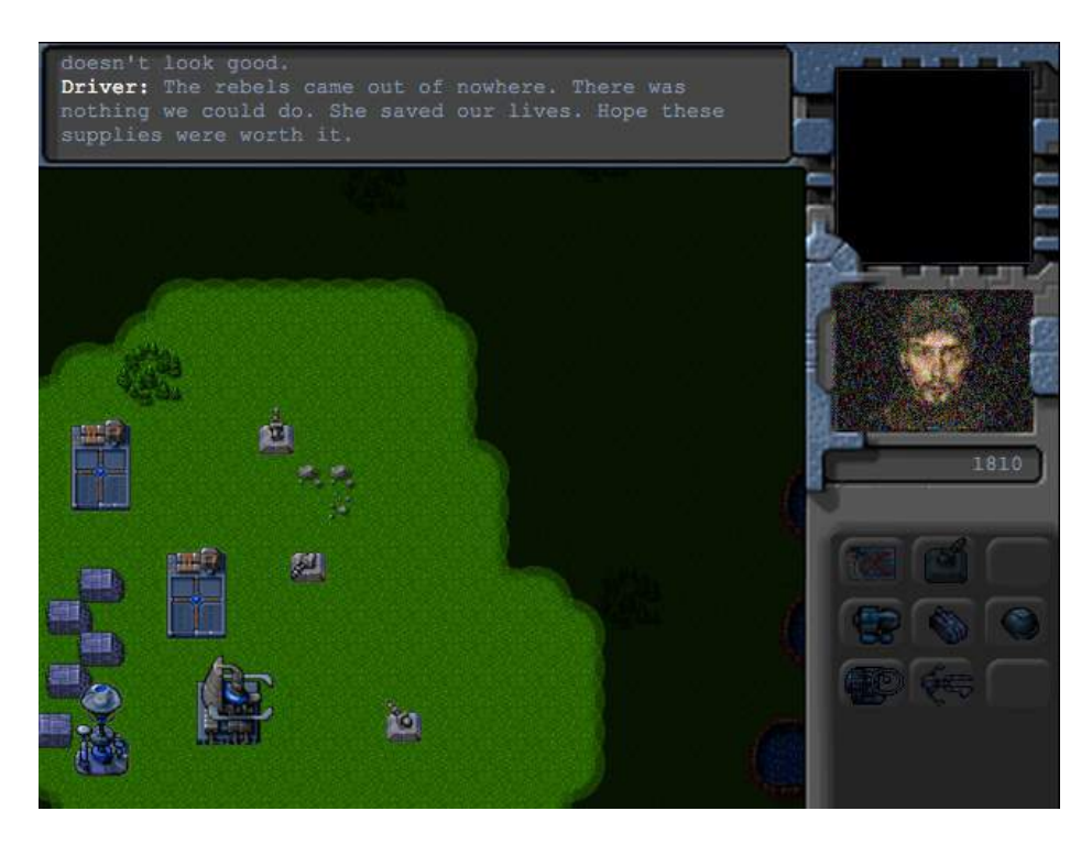
Figure 10-7. Driver describes the ordeal after getting back

At the end of the whole experience, the player now has some extra cash to start building units.