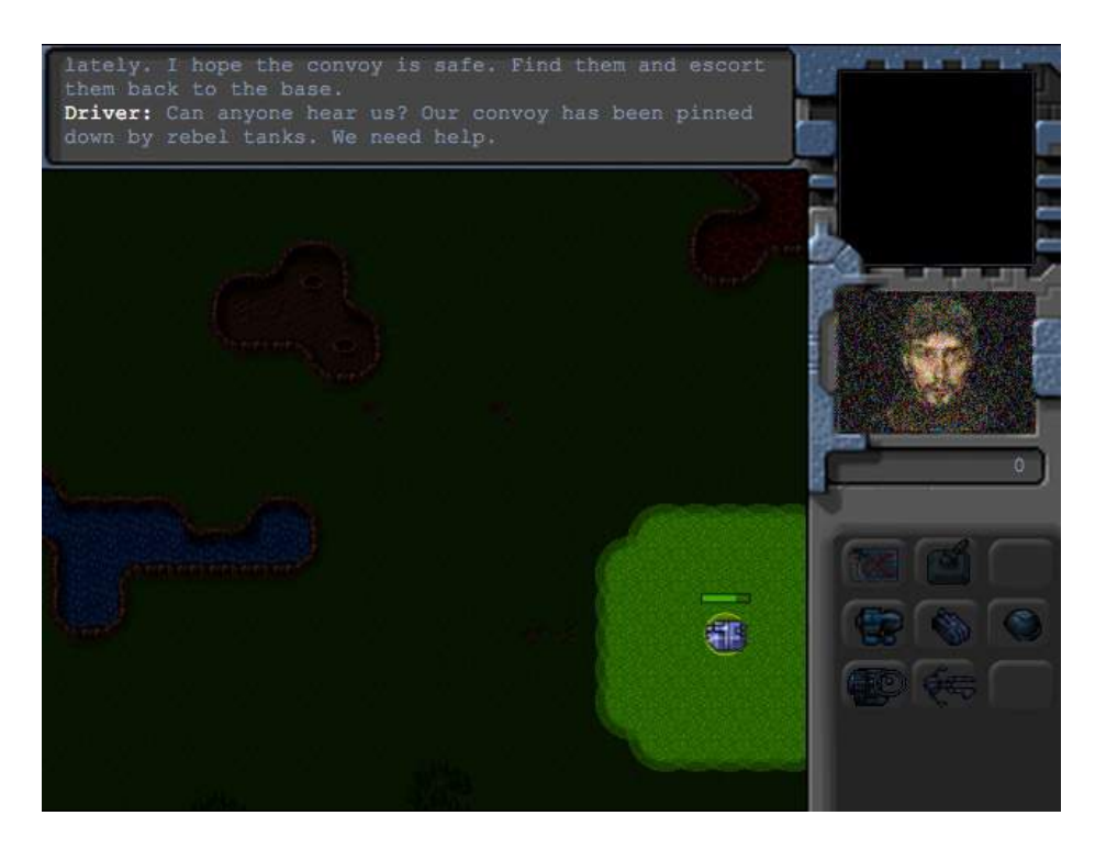
Figure 10-2. Convoy driver asking for help

If we run the game now, we should see the operator urging us to hurry after the first fight with the rebels and the convoy driver calling for help when we approach the convoy location, as shown in Figure 10-2.